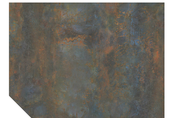
Na Pali - 2581