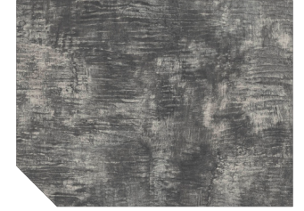
Costa Brava- 449