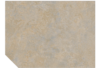
Reused Surface - 1562