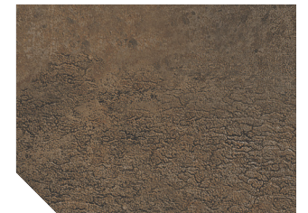
Timanfaya - 2366