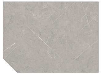
Buddha – 2455