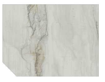
Maseió Marble – 2596