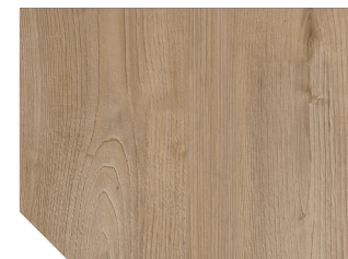
Himalayas Chestnut – 2325