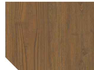
Gala Chestnut – 2253