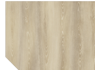
Fancy Chestnut – 2442